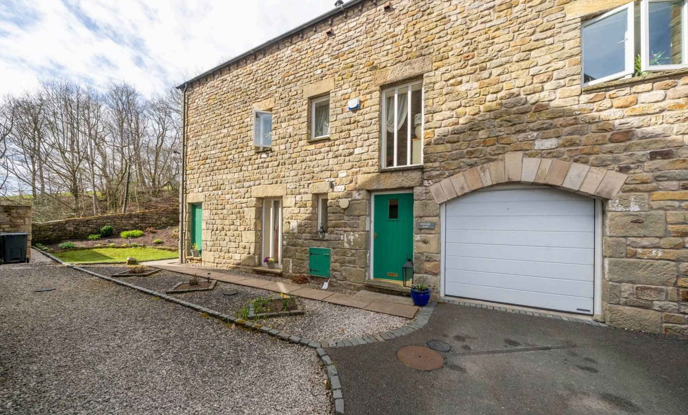
Woodside Barn, Aughton £750,000