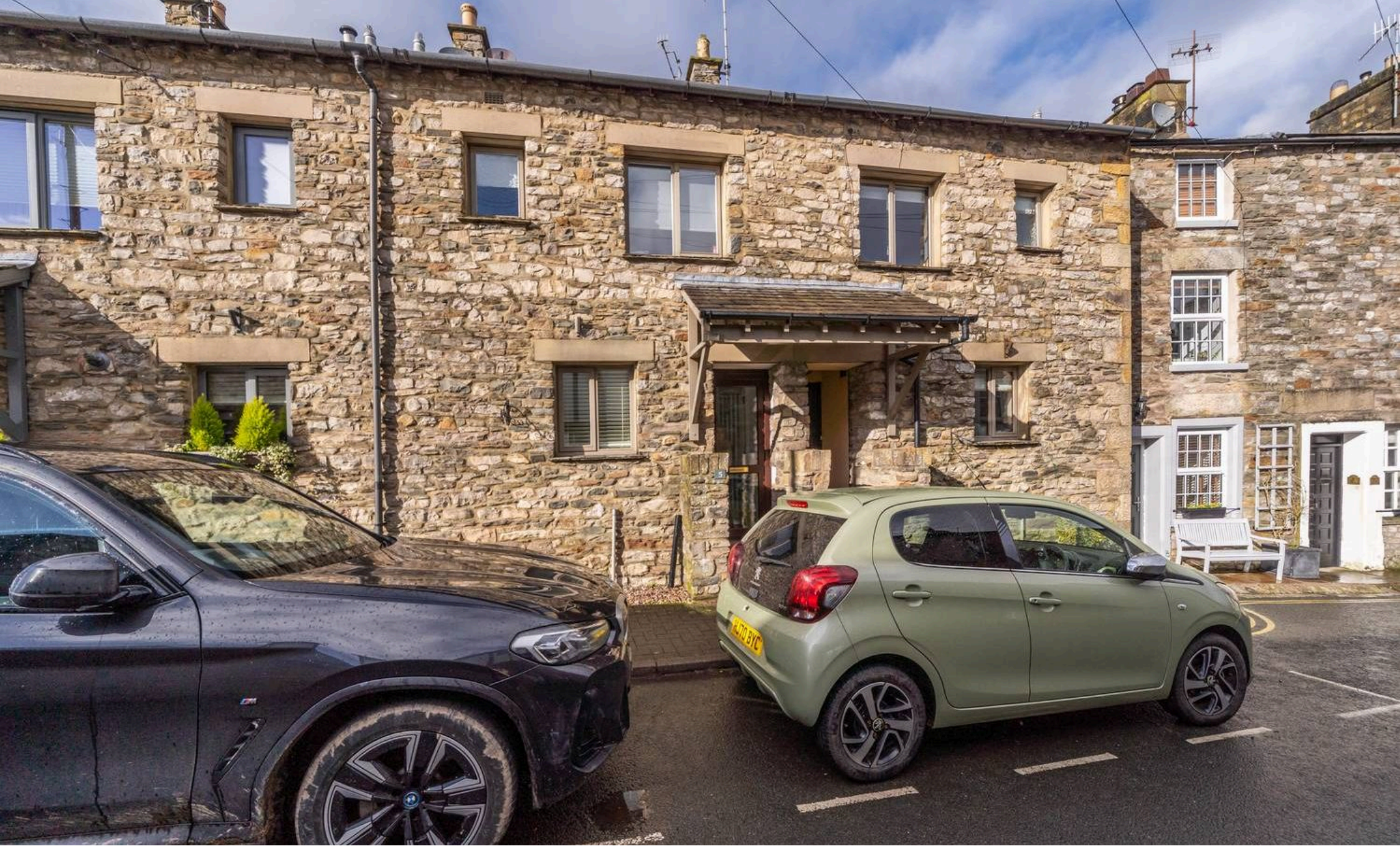
Flat 5, Abbot Hall Barn Mitchelgate, Kirkby Lonsdale £350,000