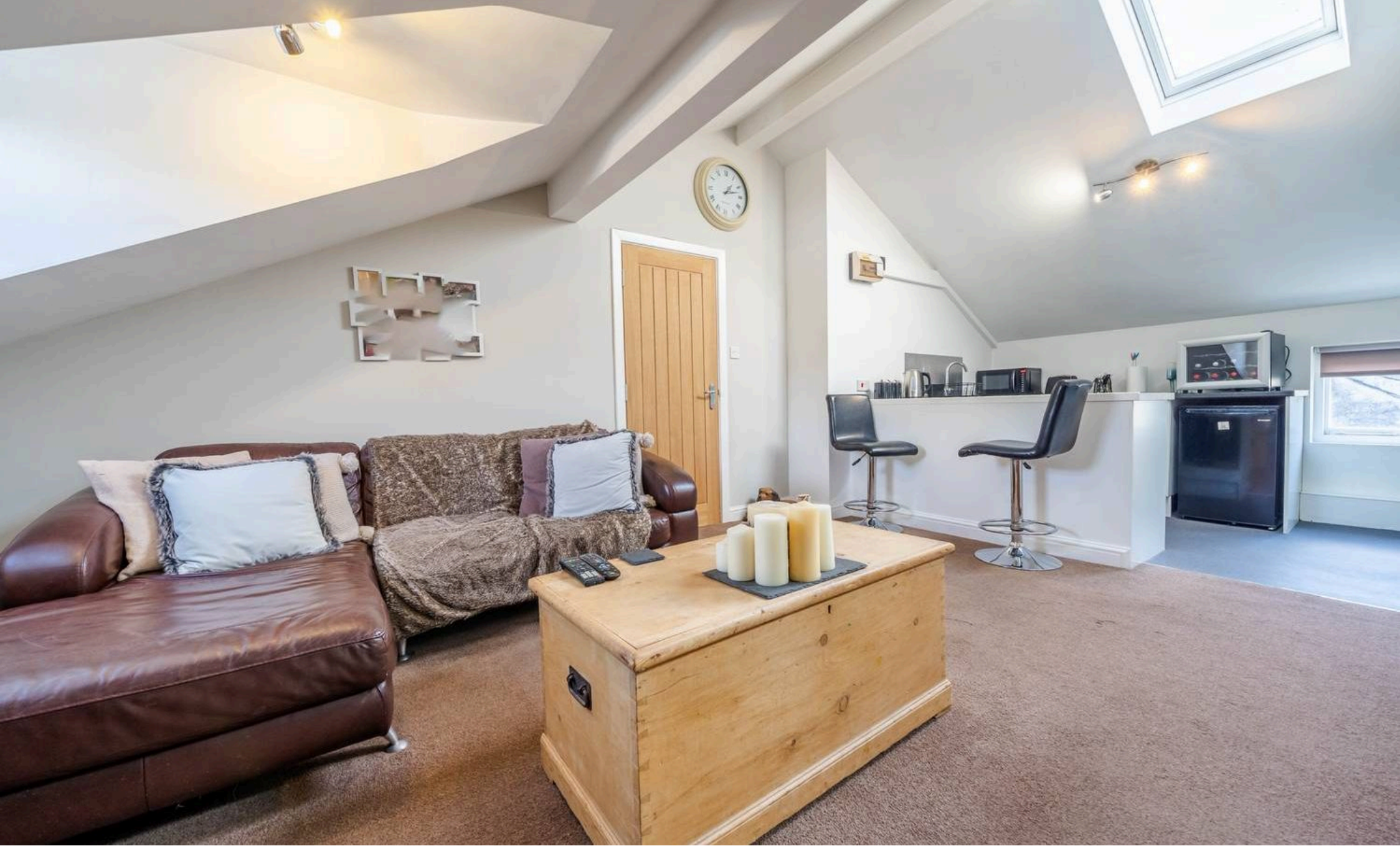
Flat 2, 36 Main Street, Kirkby Lonsdale £230,000