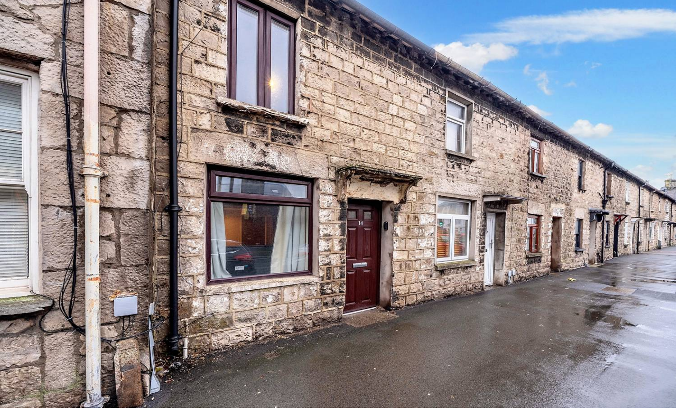
14 Longpool, Kendal £150,000