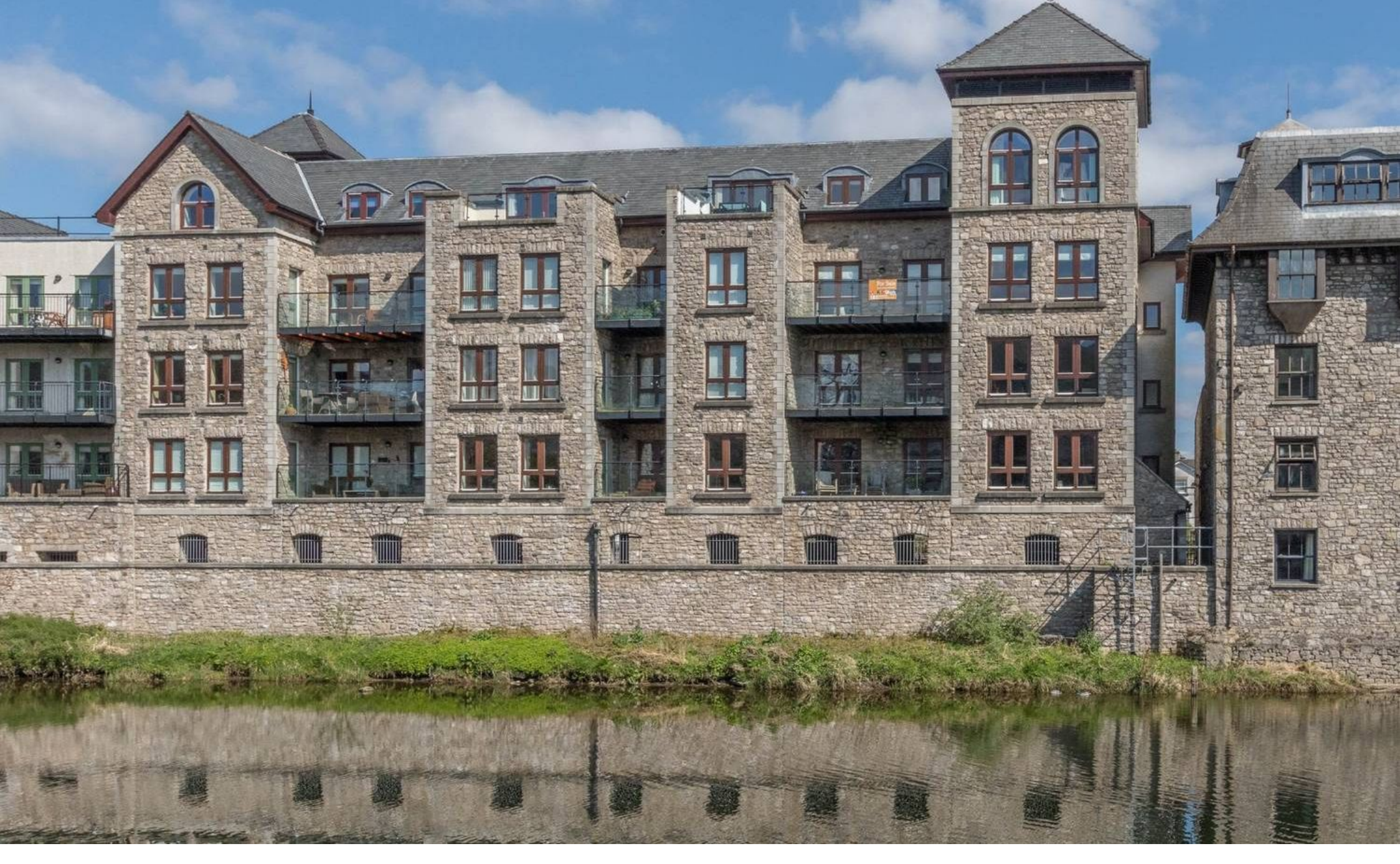
Apt 15, Kentgate Place Beezon Road, Kendal £325,000