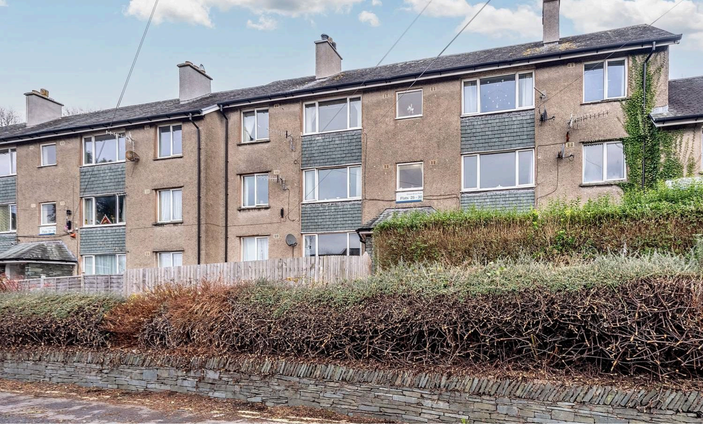
30 Orrest Drive Flats, Windermere £150,000