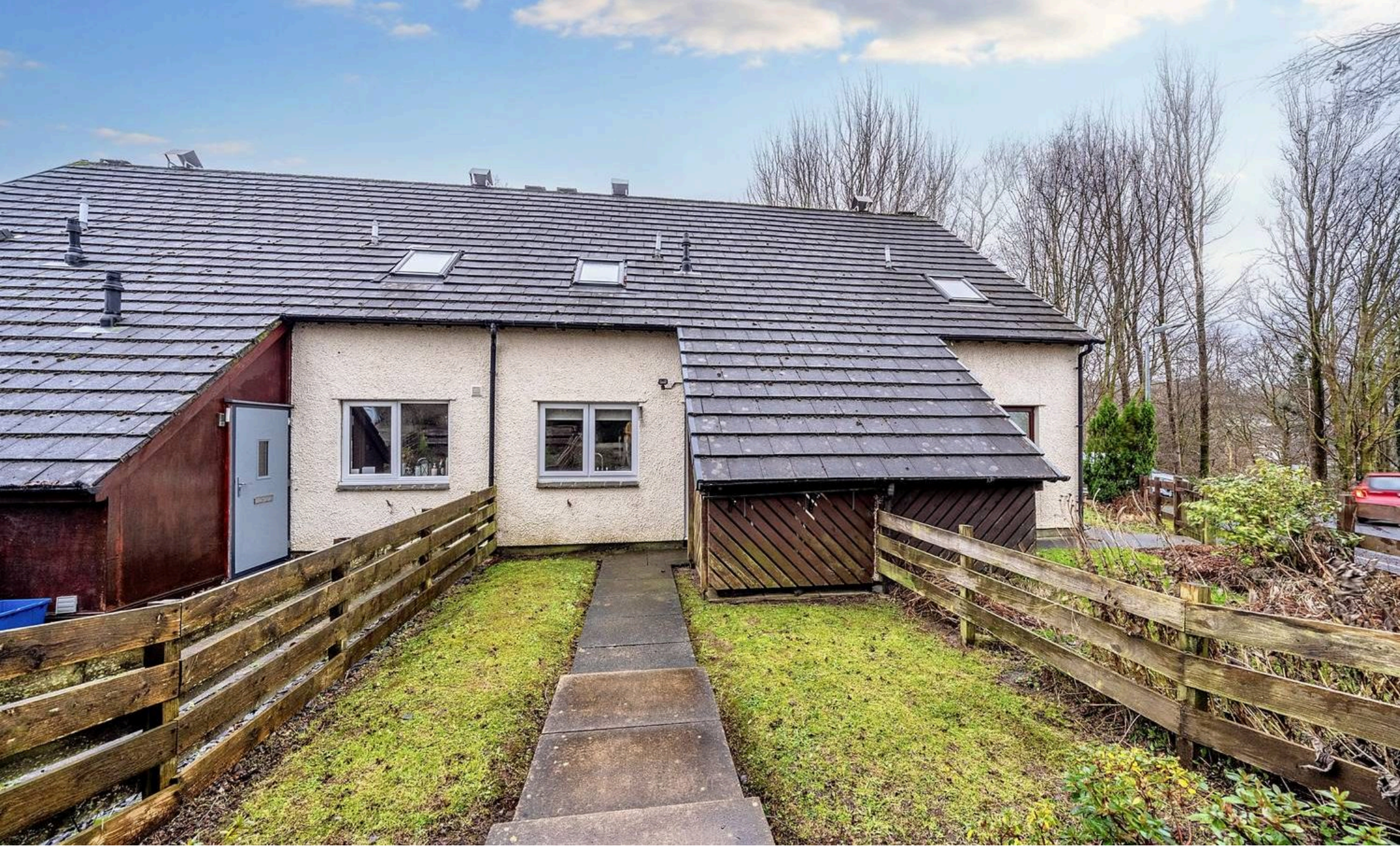
3 Droomer Lane, Windermere £220,000