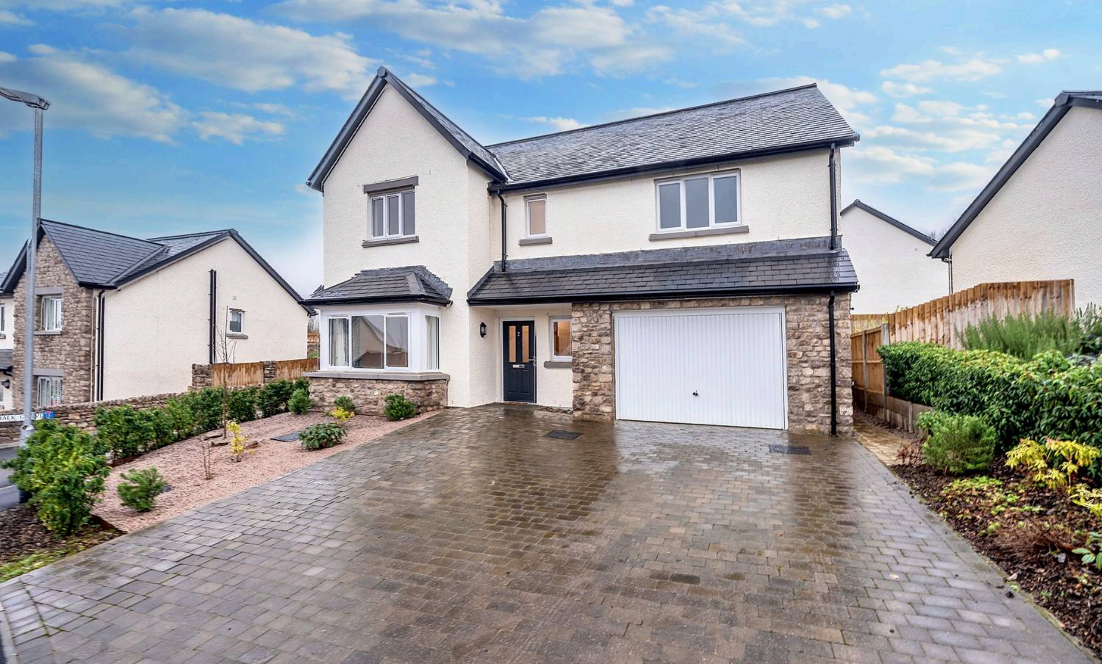
2 Chalk Grove, Kendal