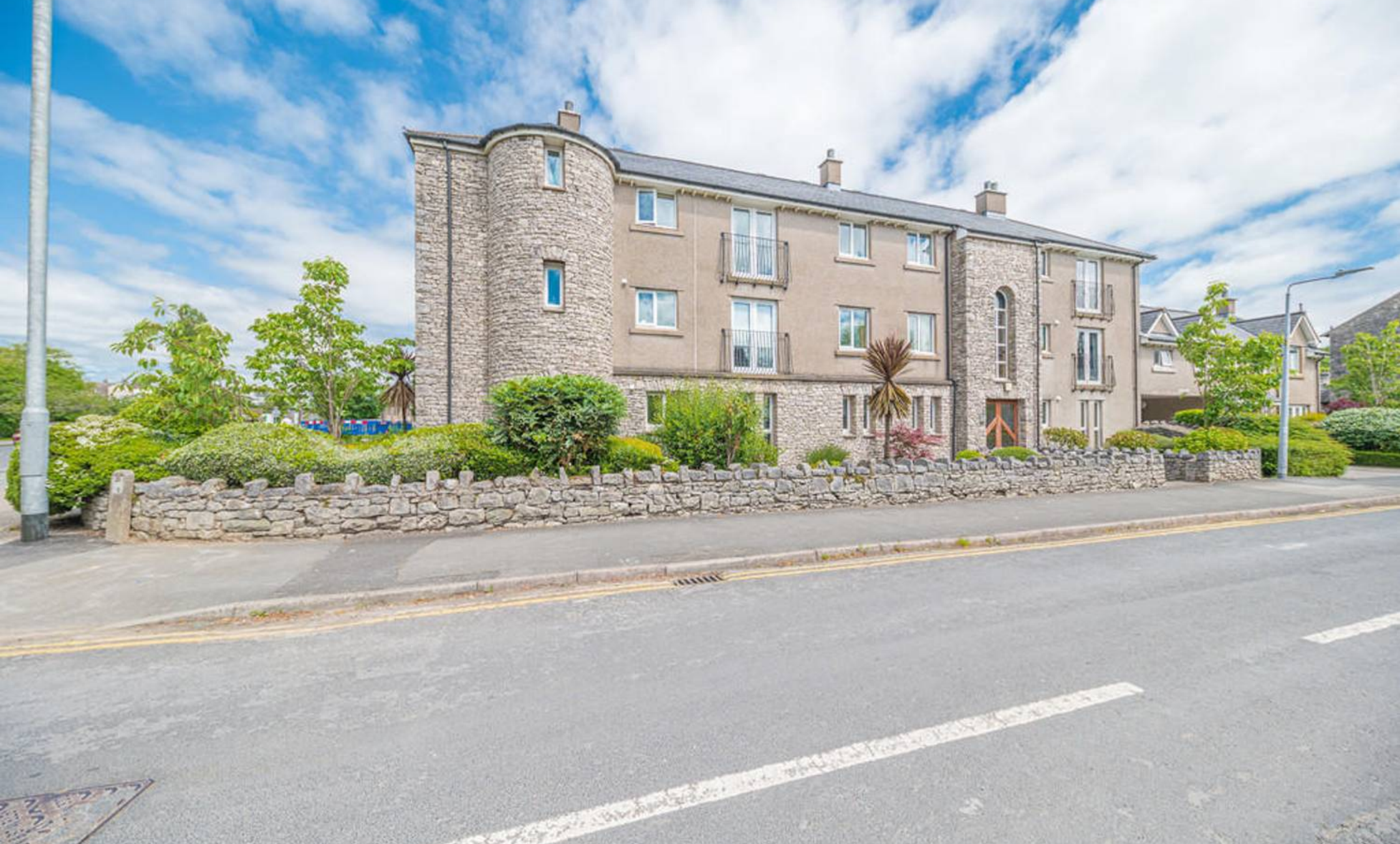
Flat 11, Weavers Court Queen Katherine Street, Kendal £192,250