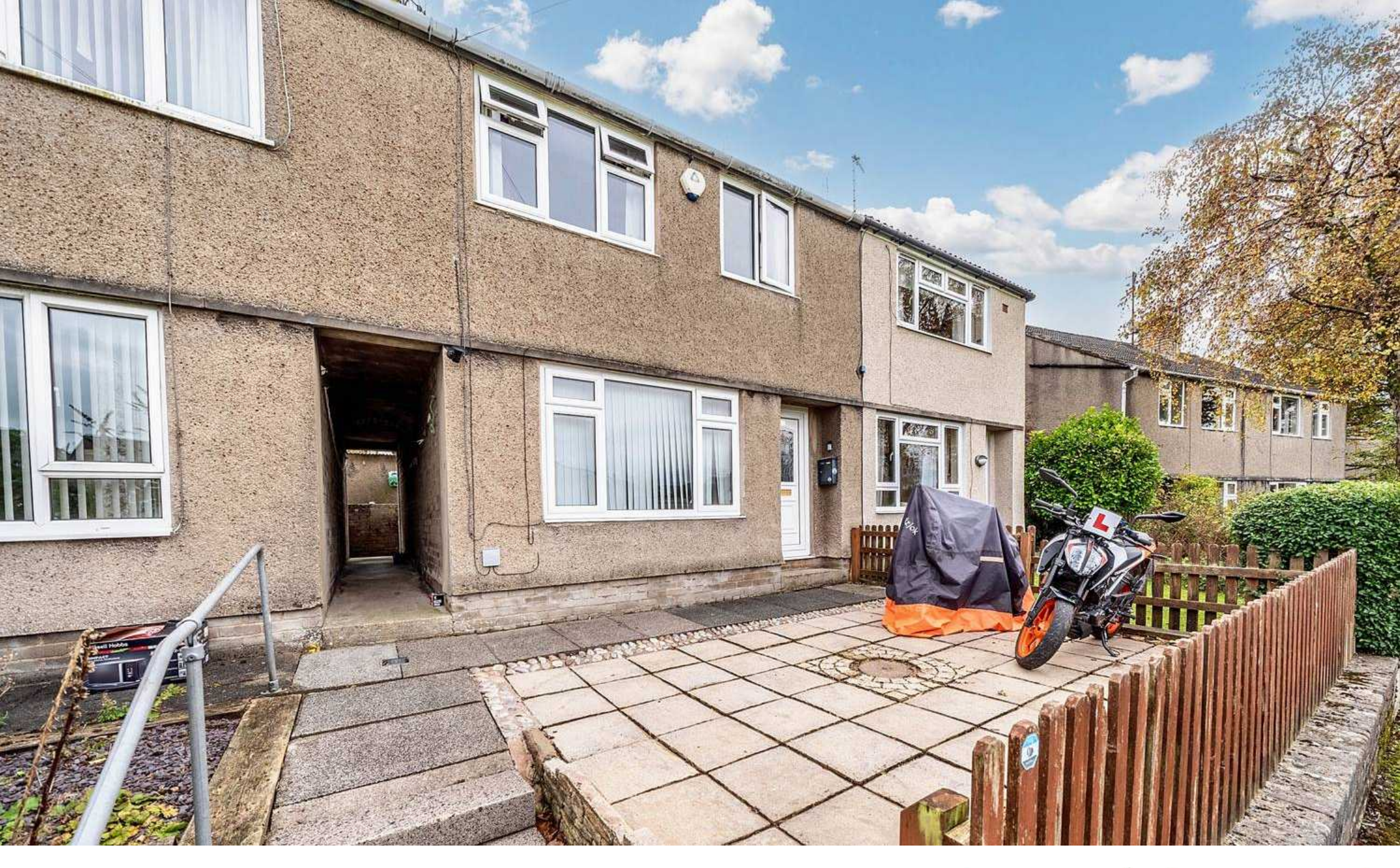
17 Coniston Drive, Kendal £212,500