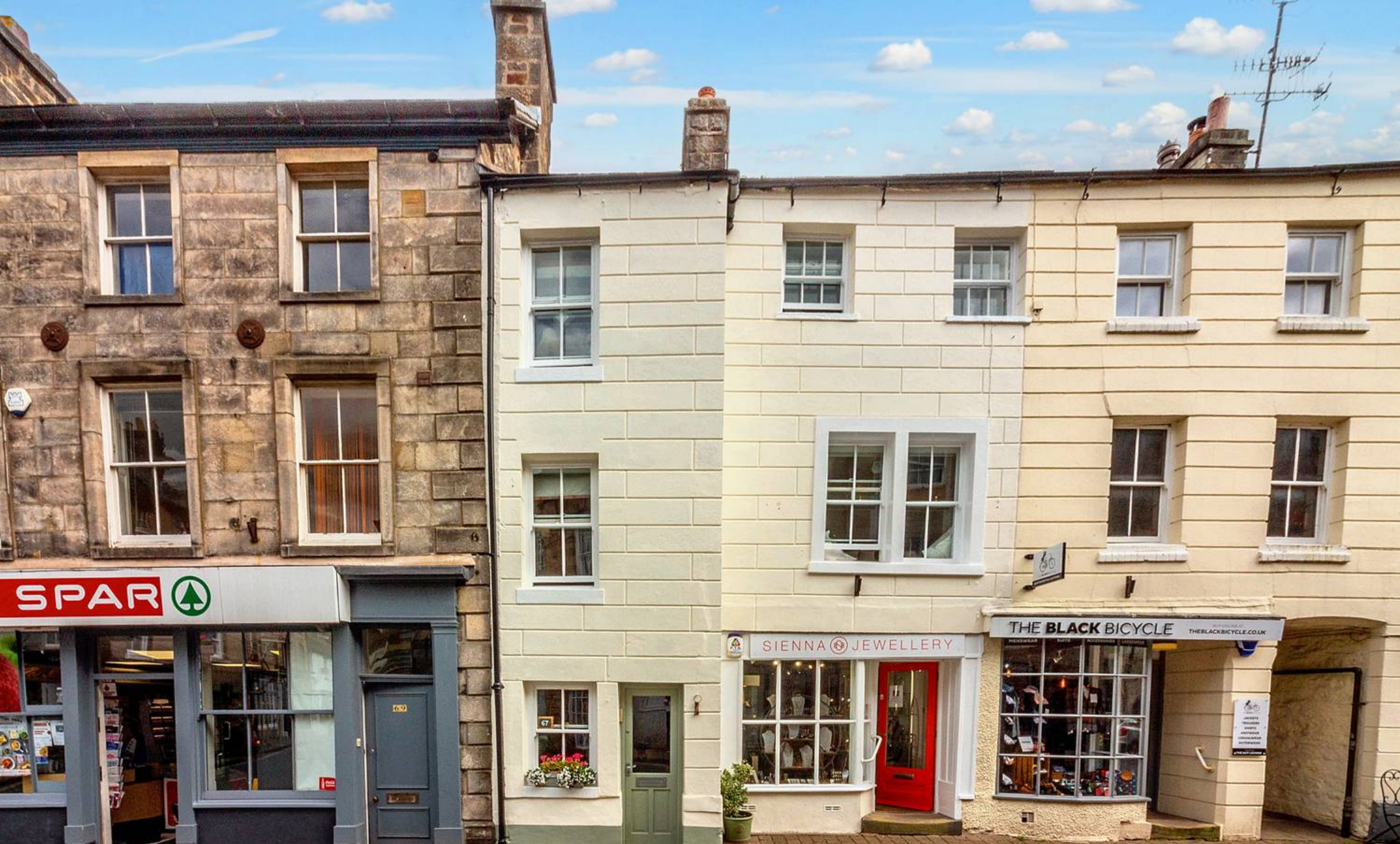
67 Main Street, Kirkby Lonsdale £285,000