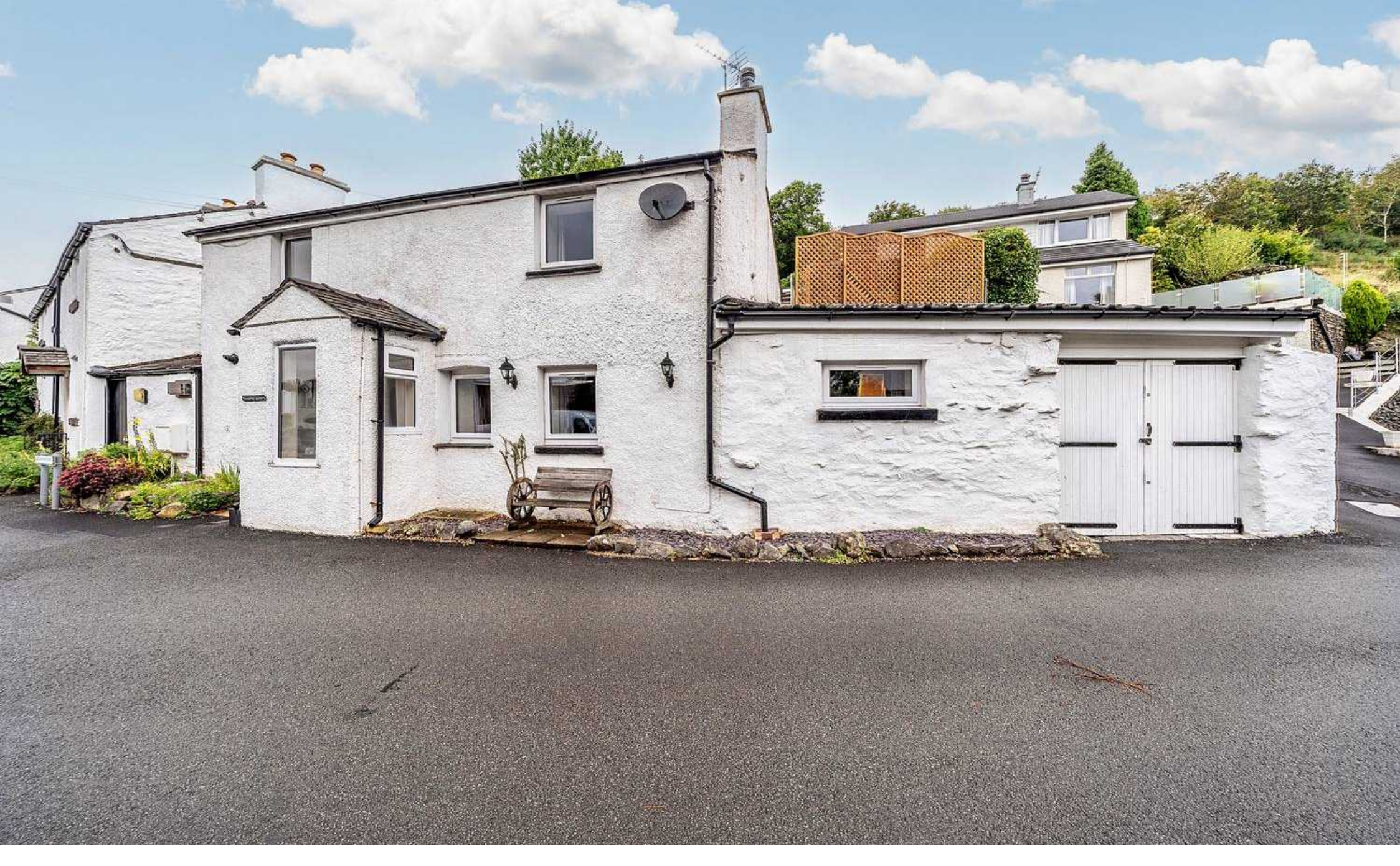
Mariners Cottage Back O The Fell Road, Lindale £350,000