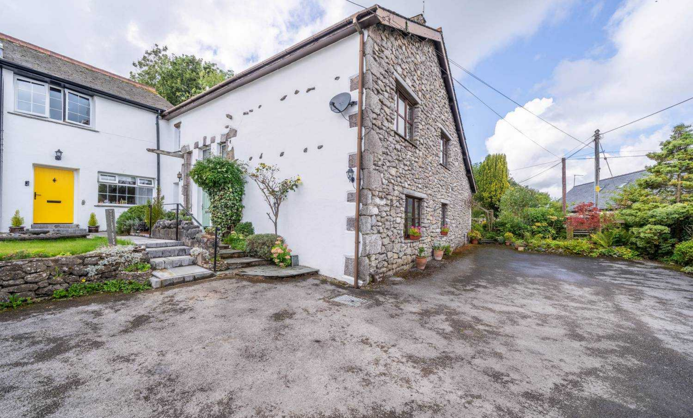
Hale Head House, Hale