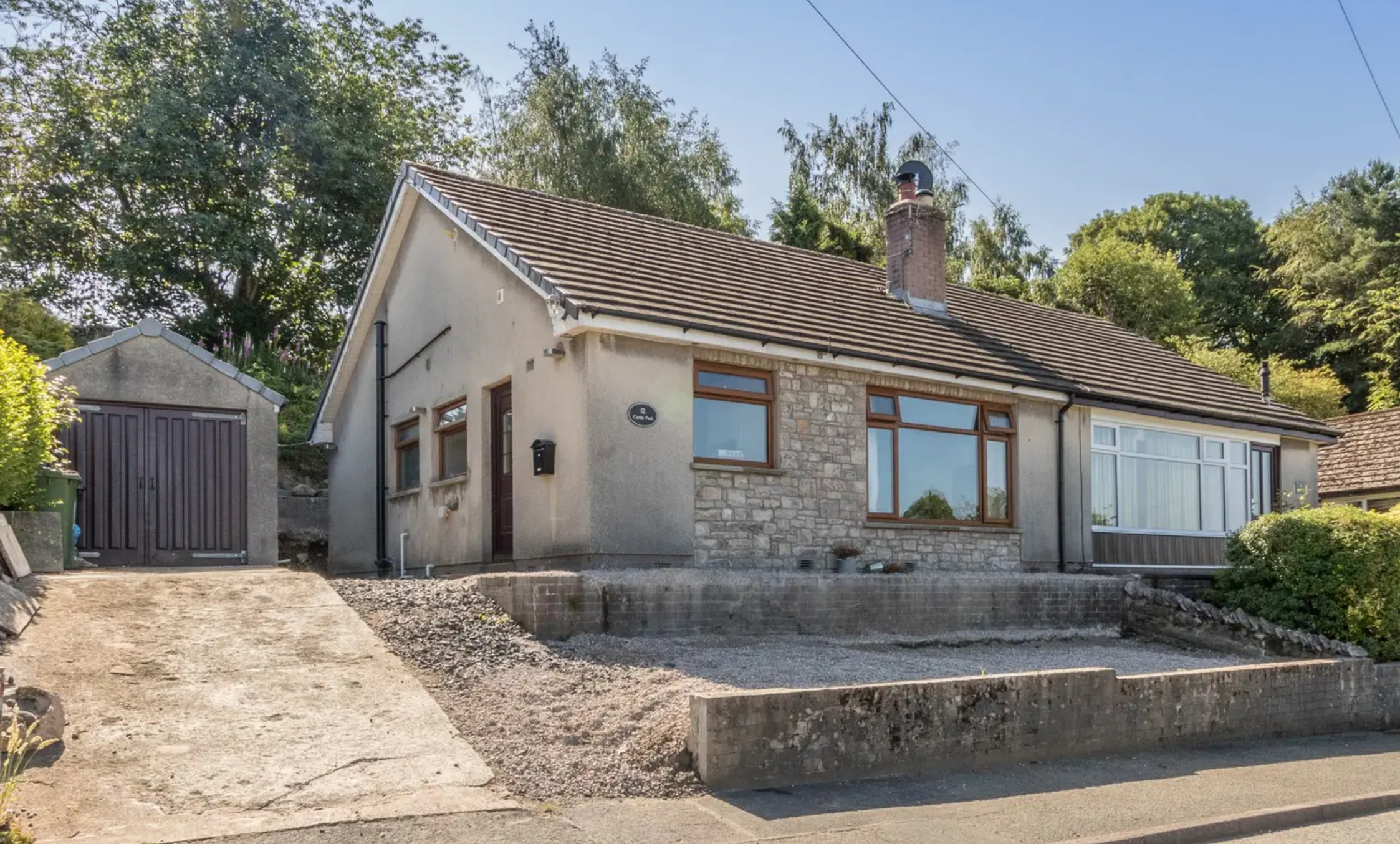
12 Castle Park, Kendal