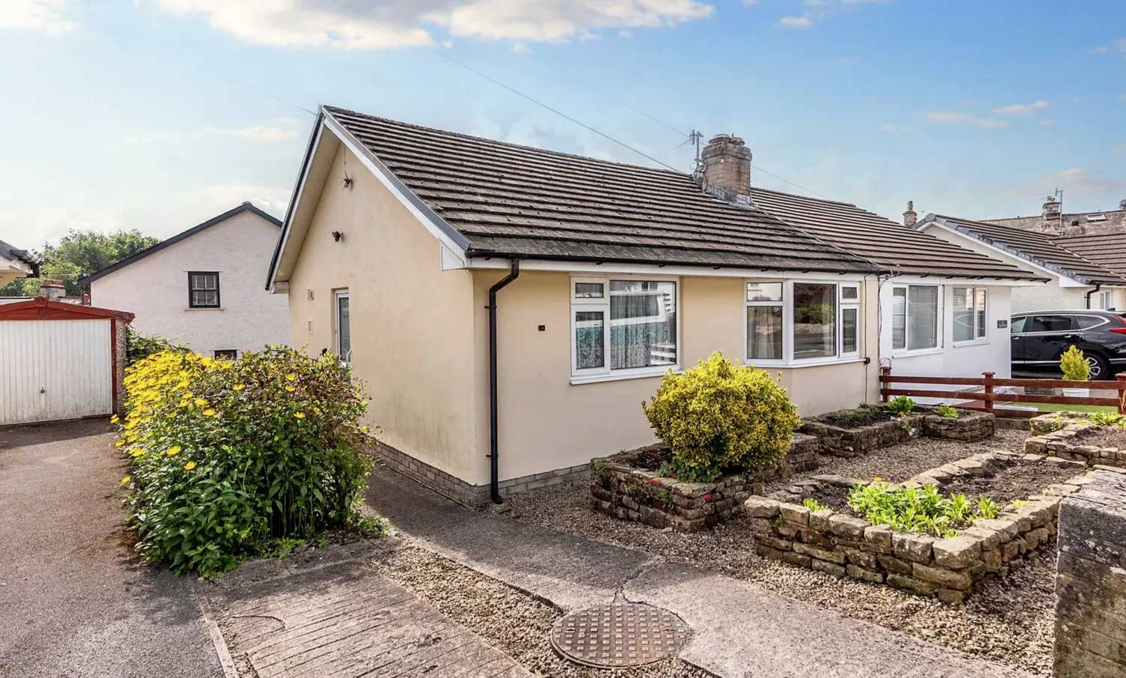
18 Rydal Mount, Kendal