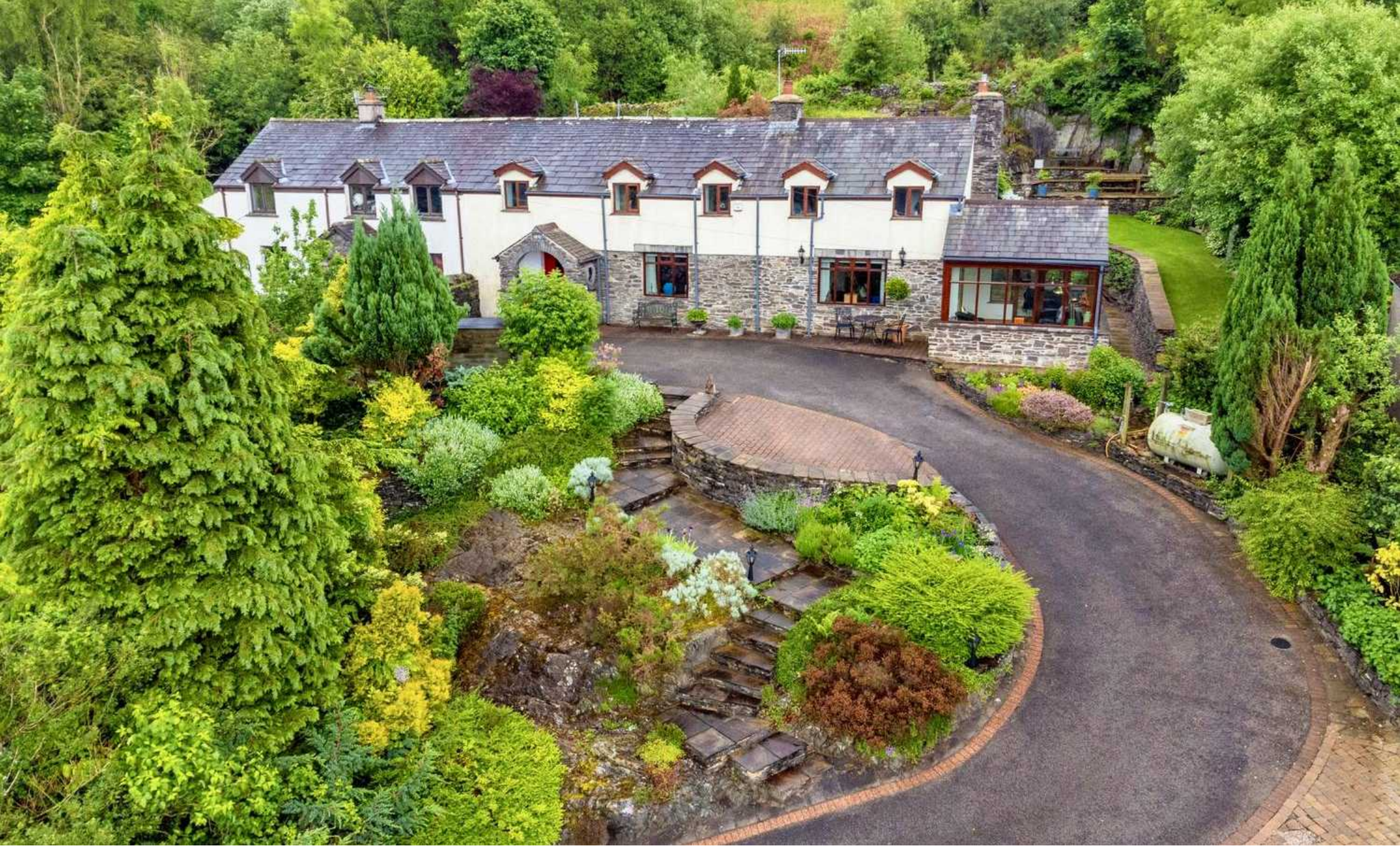
Old School Cottage Brow Edge Road, Backbarrow £750,000