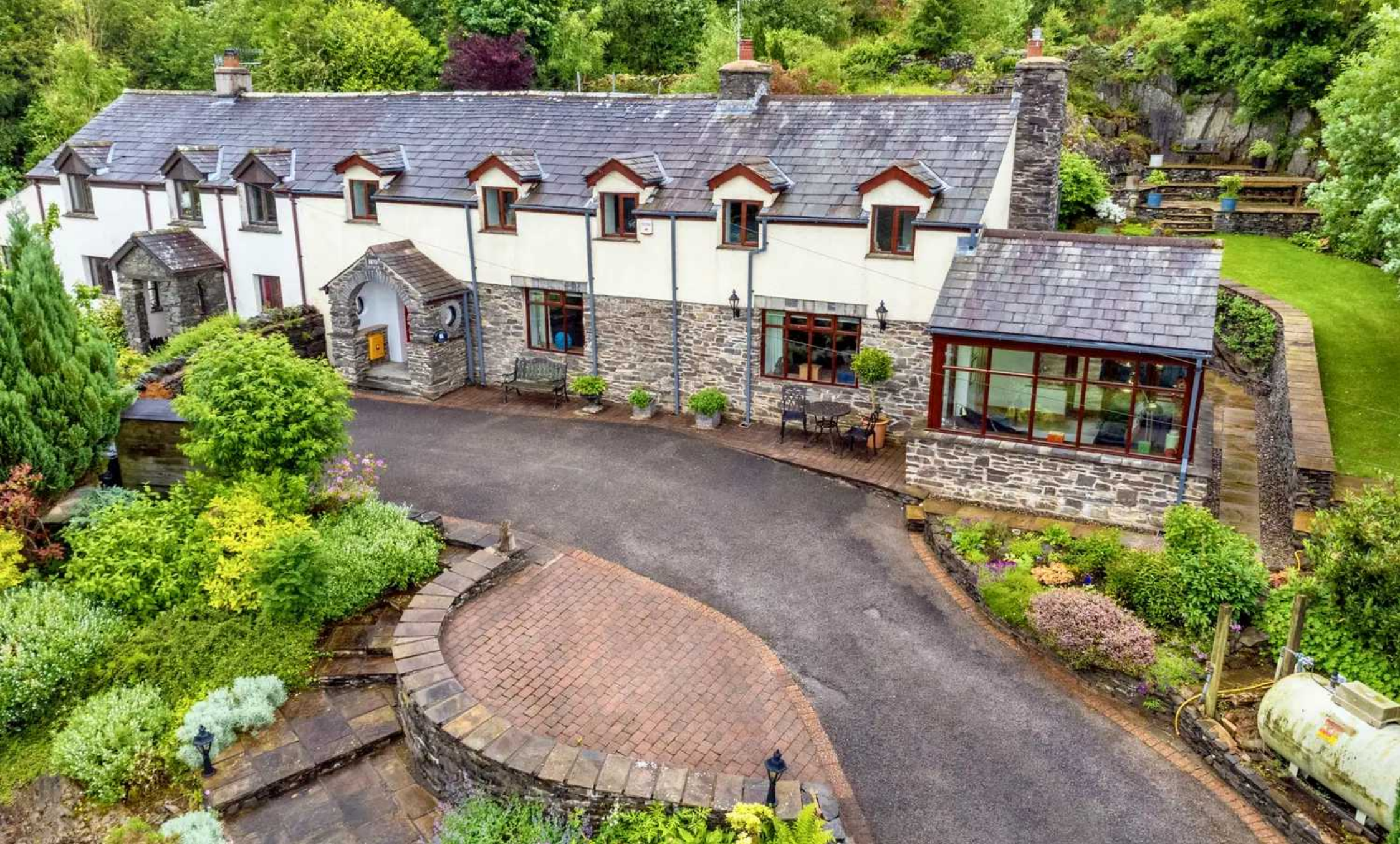
Old School Cottage Brow Edge Road, Backbarrow £800,000