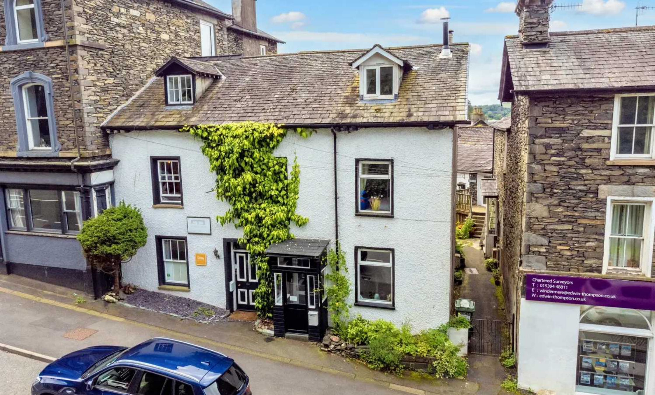
19 Church Street, Windermere £450,000