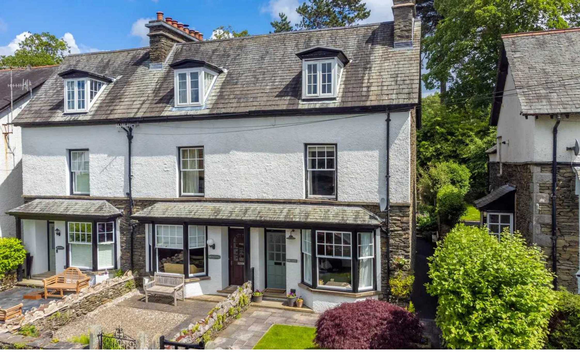
The Cote Beresford Road, Windermere £560,000