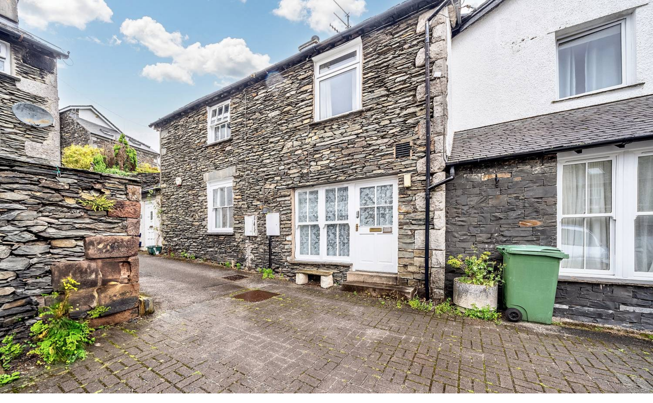
Beech Cottage Derby Square, Windermere £285,000