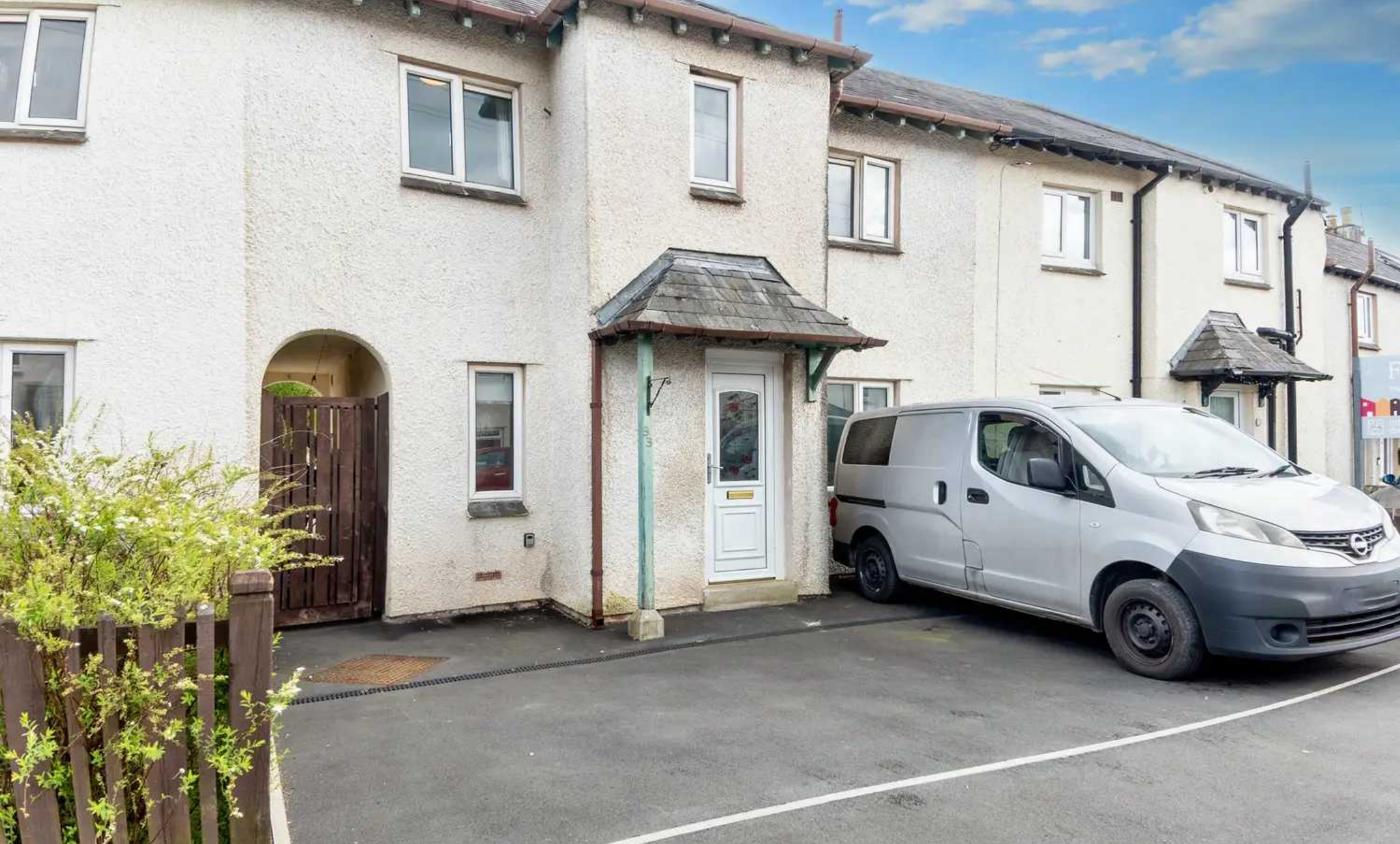
33 Broad Ing, Kendal £200,000