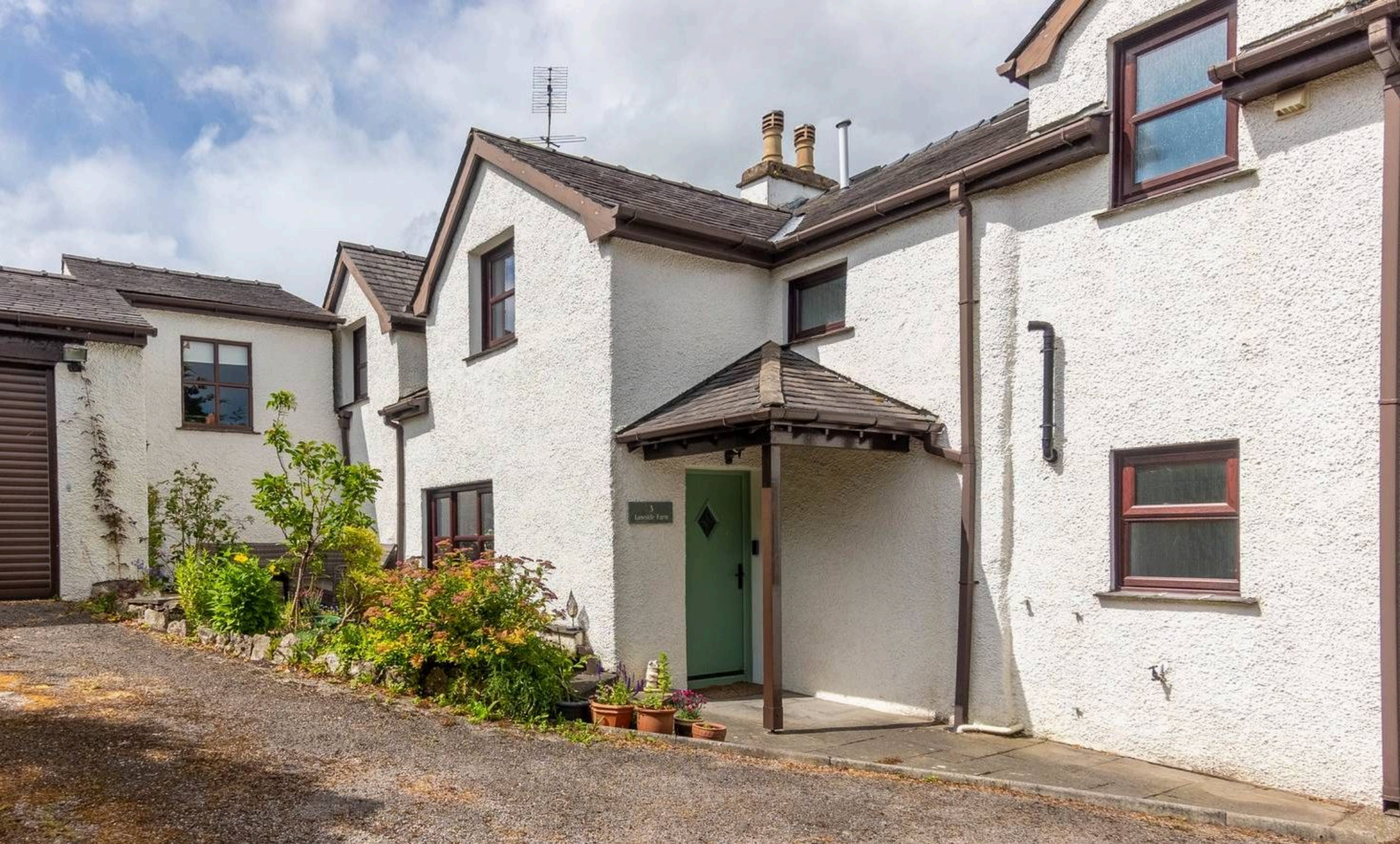
3 Laneside Farm Kirkhead Road, Grange-Over-Sands £290,000