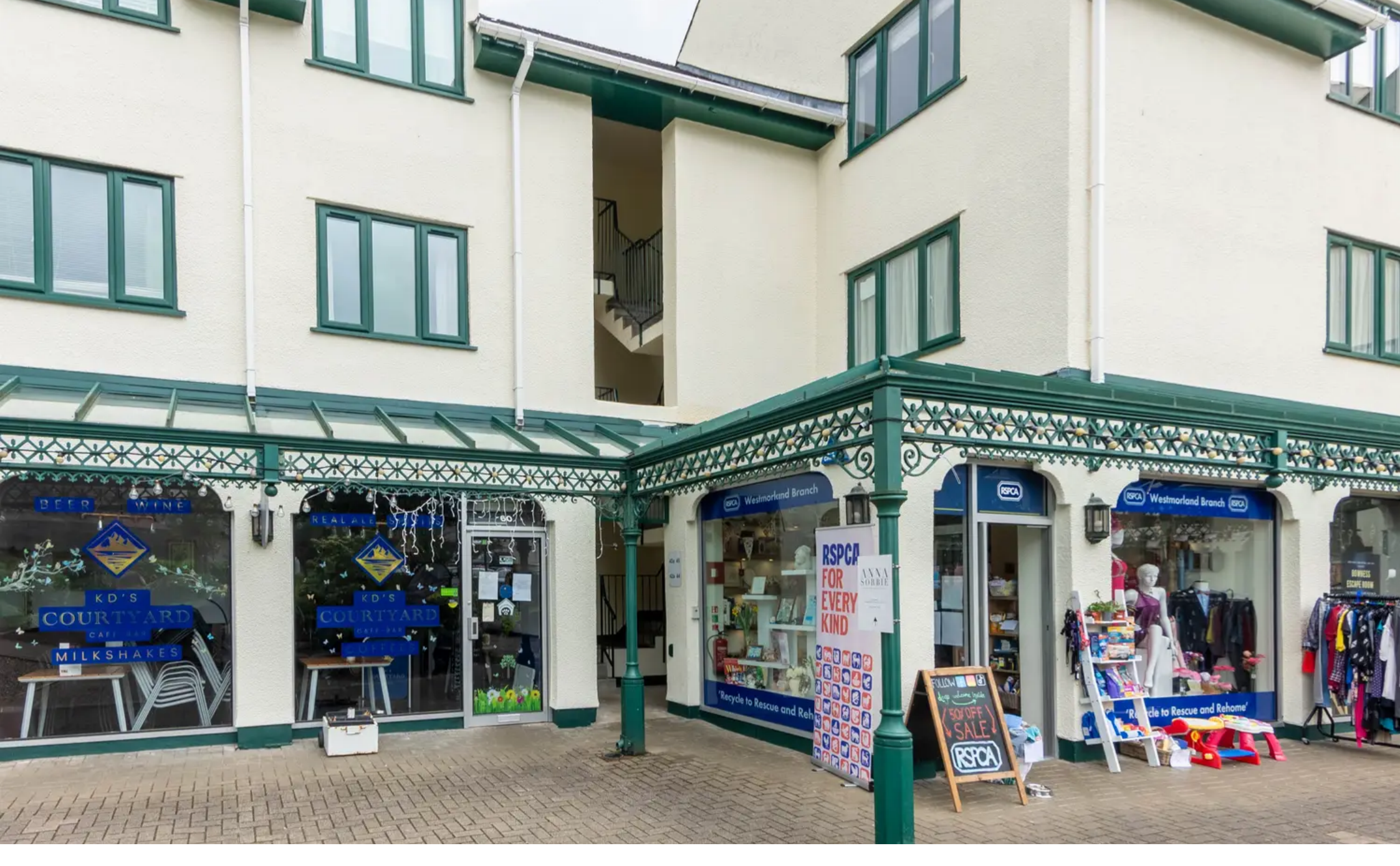
42a Quarry Rigg, Bowness-On-Windermere In Excess of £200,000