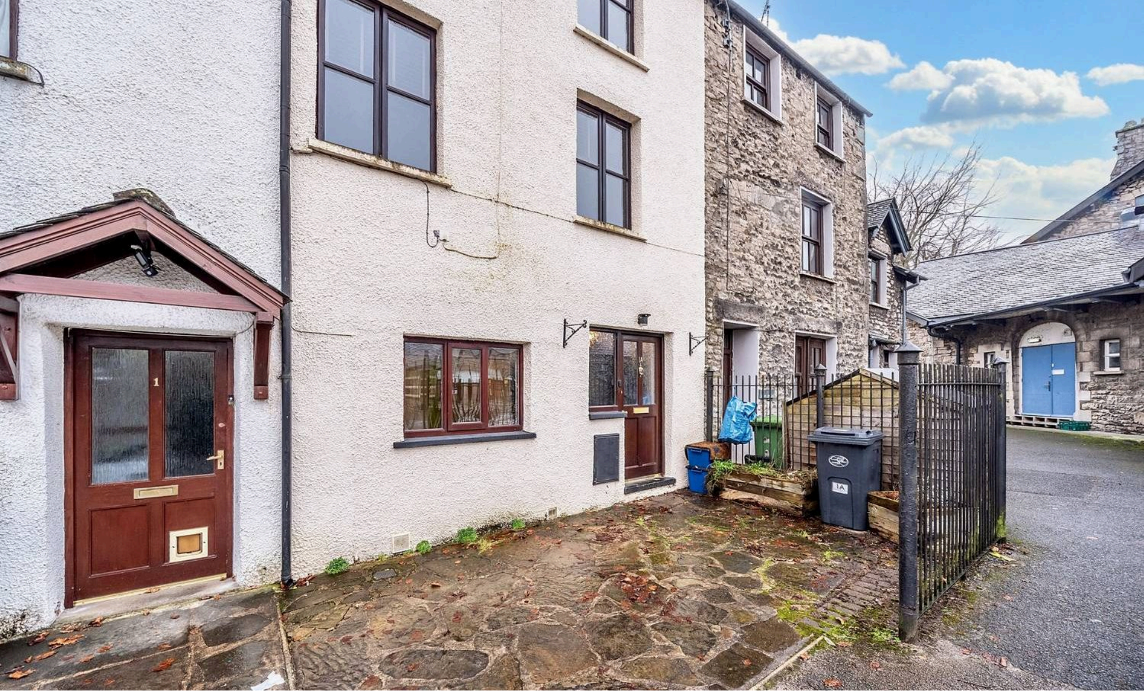
1a Stramongate Hall Cottage, Yard 56 Stramongate £210,000