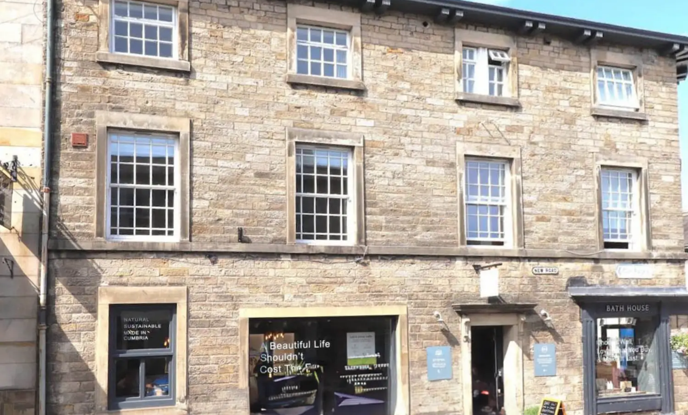
Flat 2, Georgian House, 1 New Road