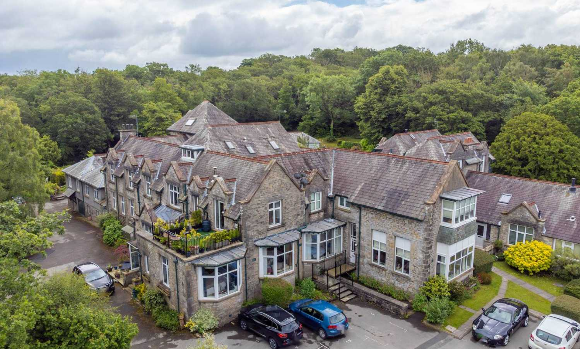
16 Meathop Grange, Meathop £225,000