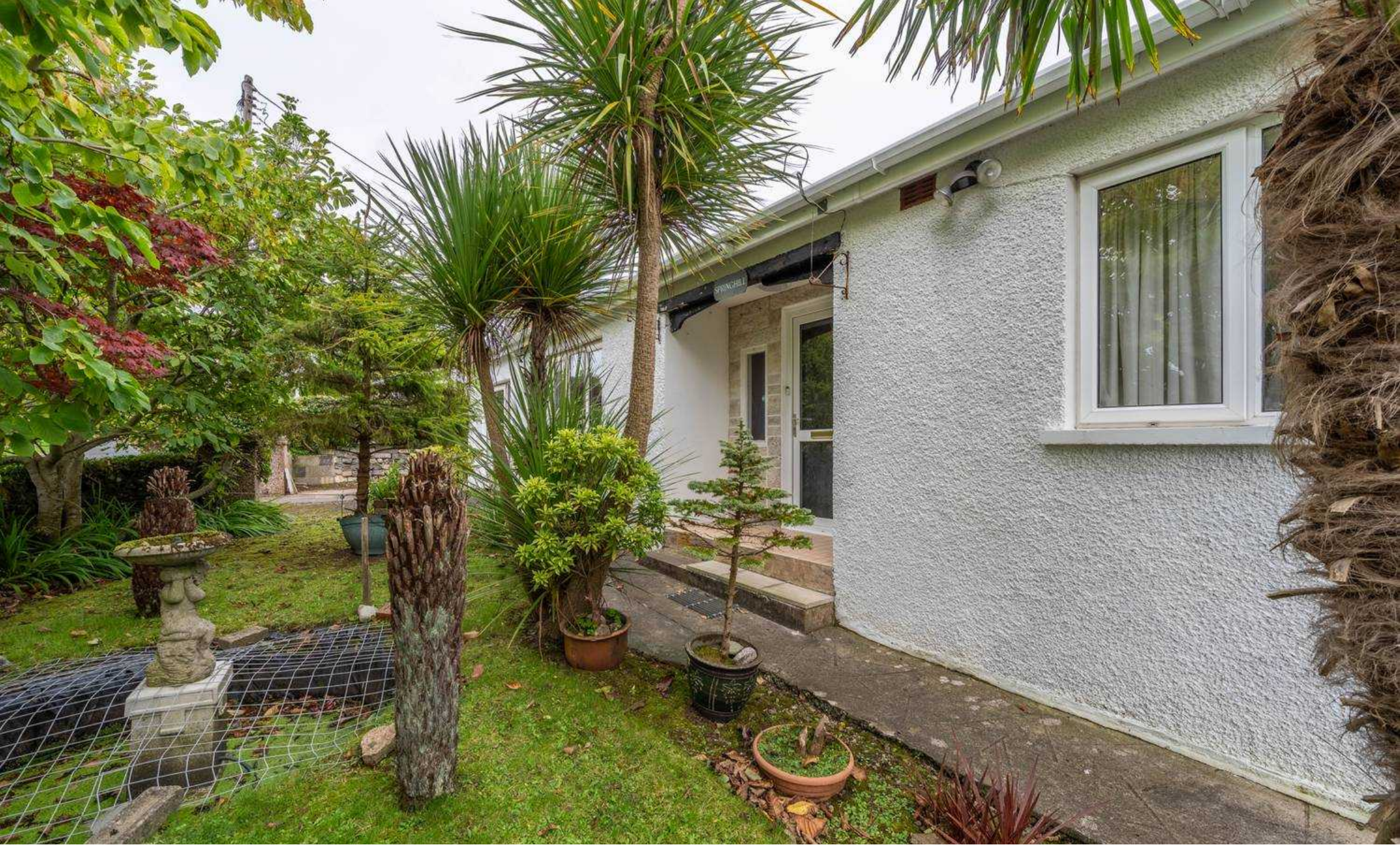
Spring Hill Templands Lane, Allithwaite £325,000