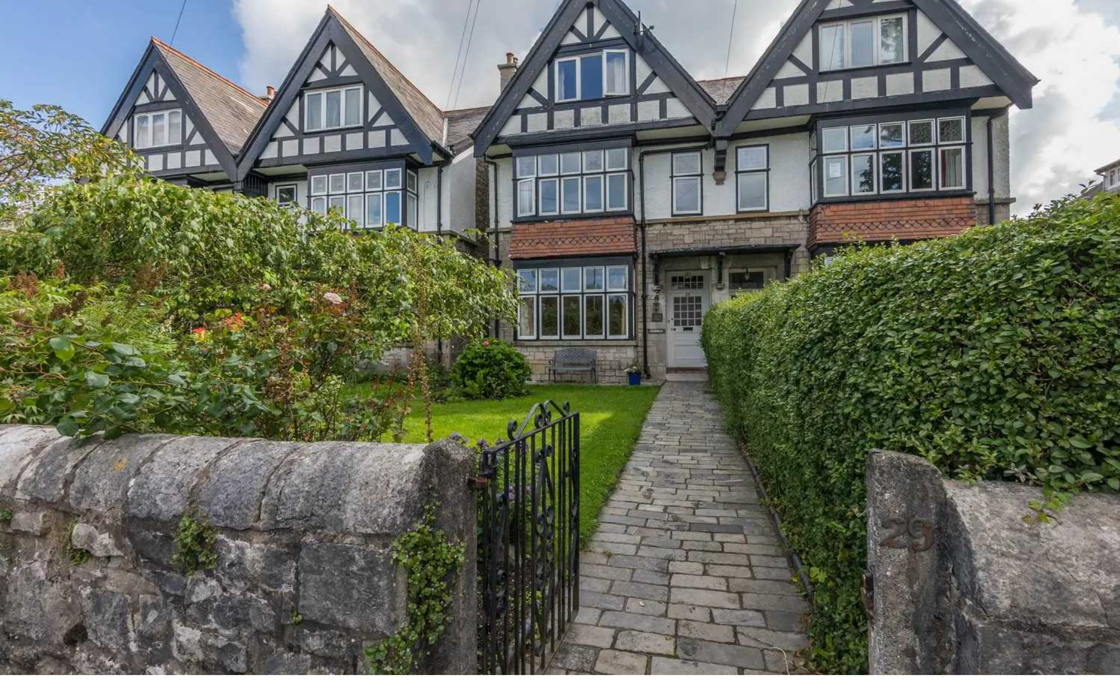
29 Sedbergh Road, Kendal £620,000