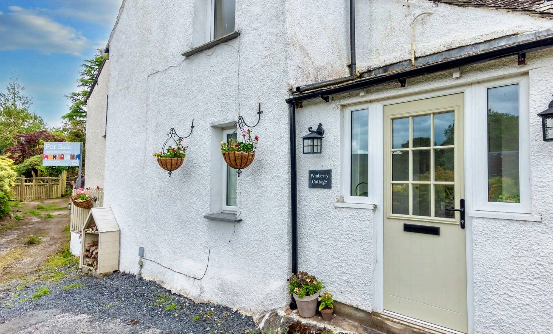
Winberry Cottage, Finsthwaite £250,000