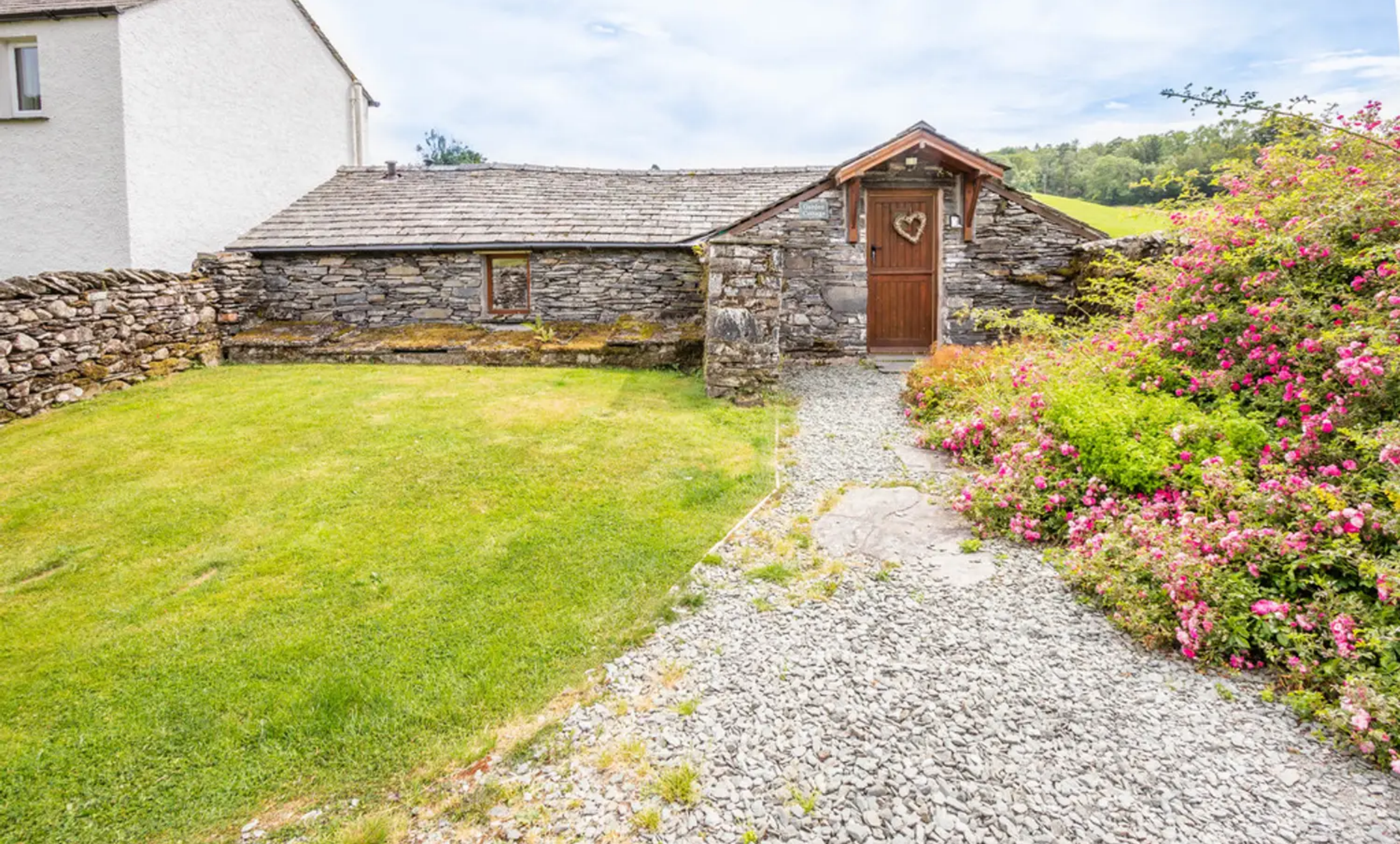
Garden Cottage, Pull Woods £290,000