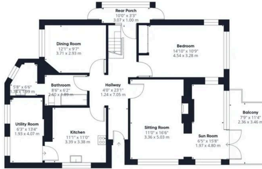
Ground Floor Building 1