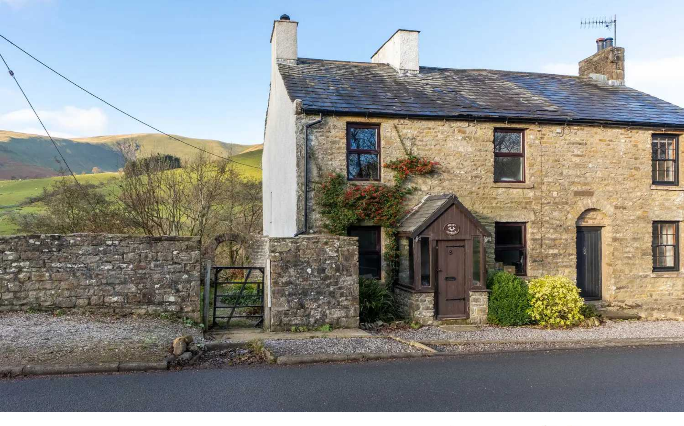
Bratt Cottage, Cautley Offers Over £300,000 Freehold