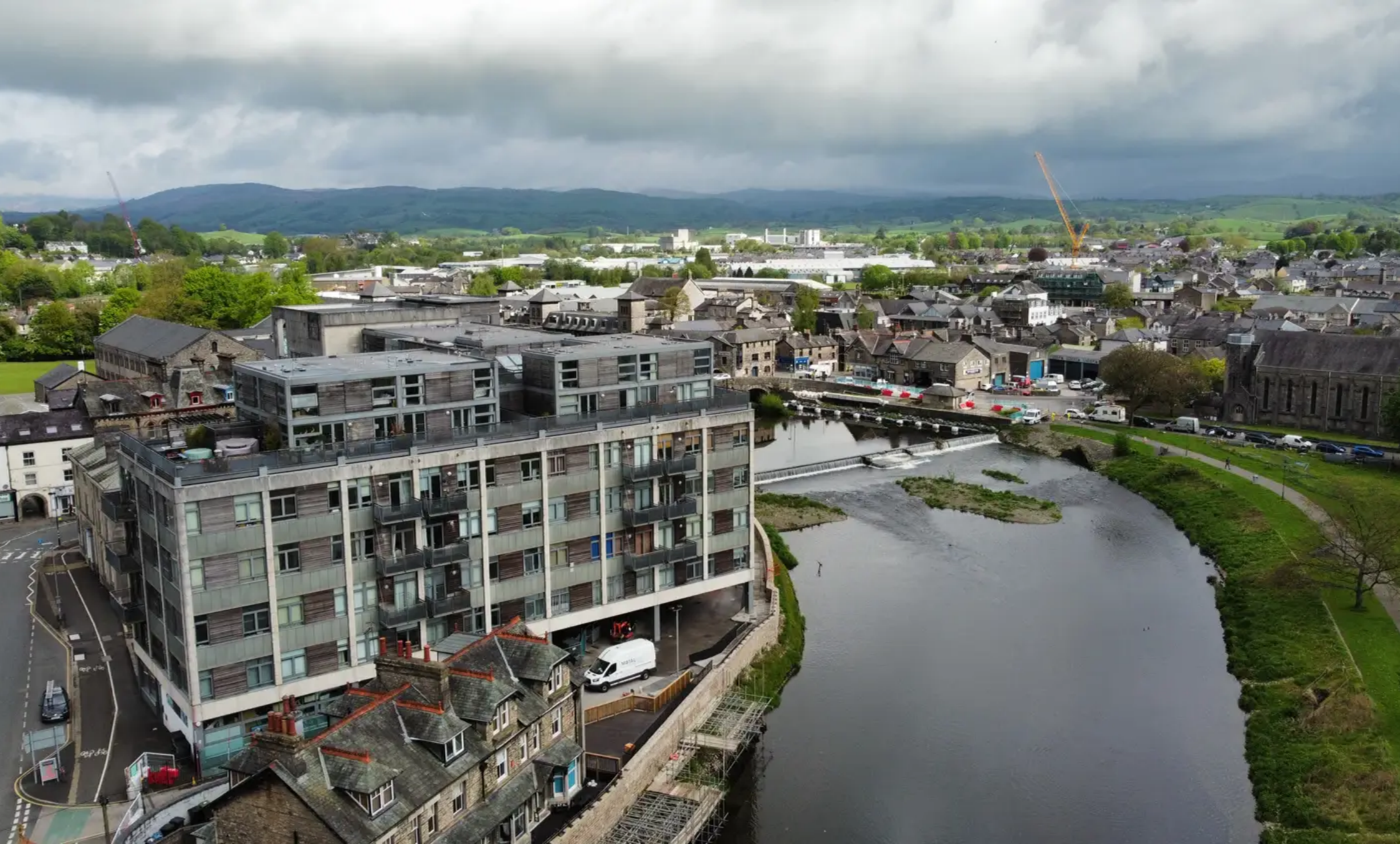
515 Sand Aire House Stramongate, Kendal