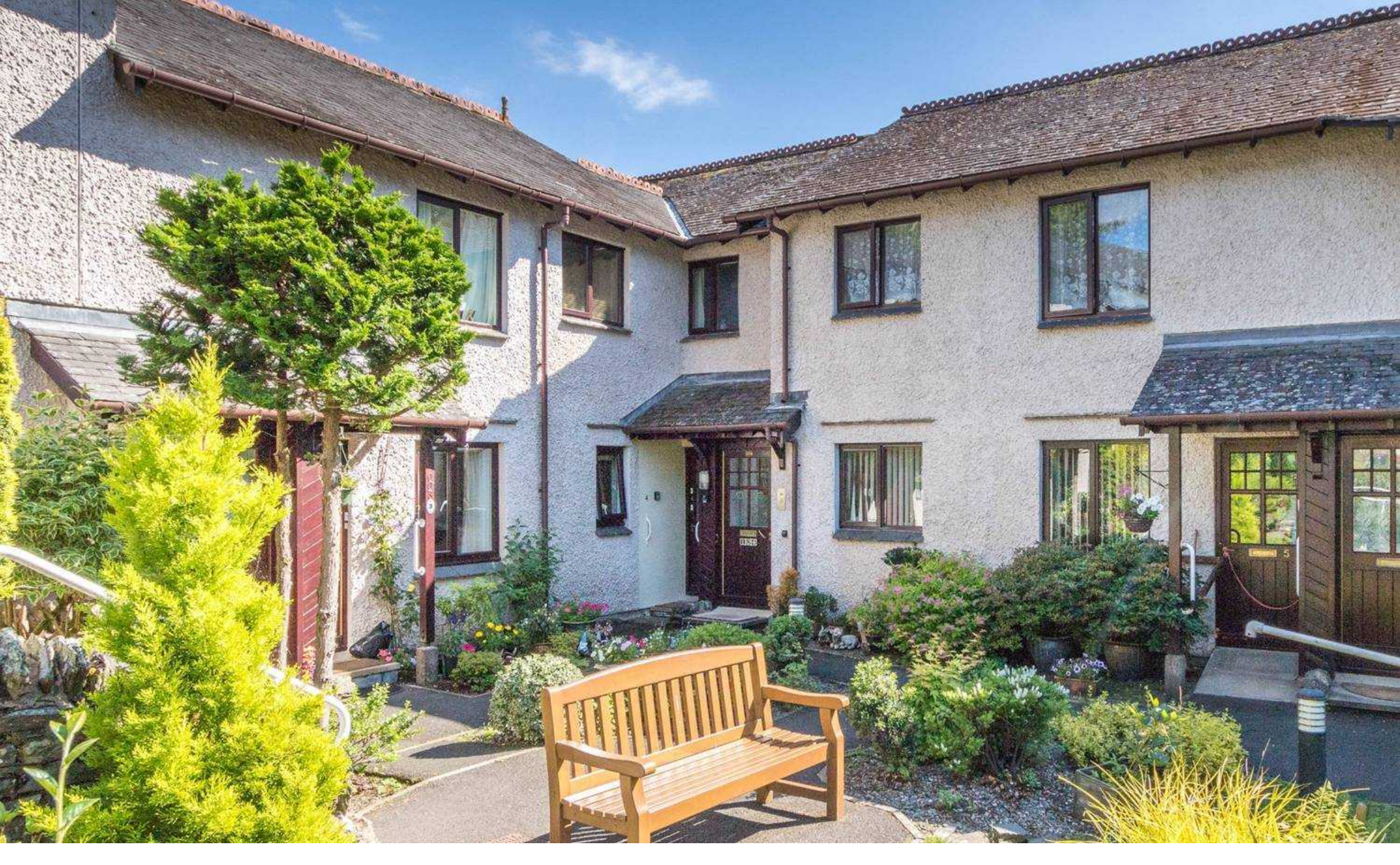
104 Elleray Gardens, Windermere In Excess of £150,000